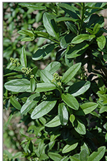
California Privet foliage

California Privet will grow to be about 10 feet tall at maturity, with a spread of 10 feet. It has a low canopy with a typical clearance of 1 foot from the ground, and is suitable for planting under power lines. It grows at a fast rate, and under ideal conditions can be expected to live for approximately 30 years.