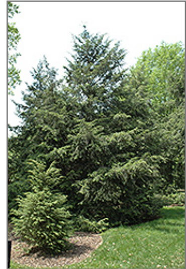
Canadian Hemlock