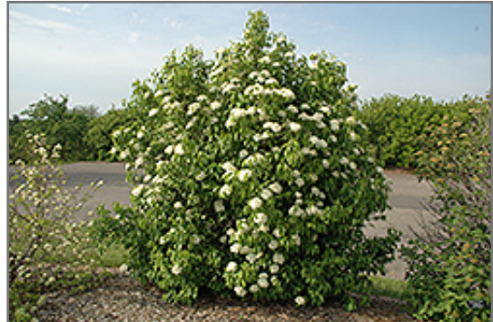
Nannyberry in bloom