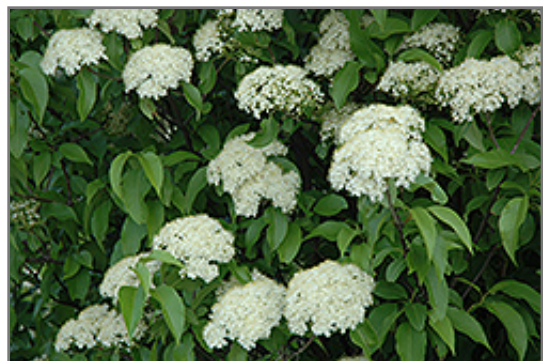
Nannyberry flowers