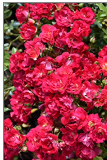
Red Drift Rose flowers

Red Drift Rose is recommended for the following landscape applications;