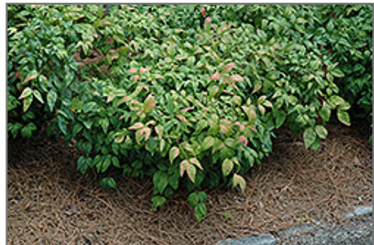
Fire Power Nandina