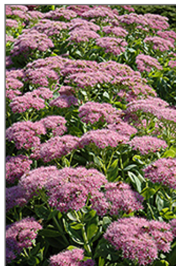
Brilliant Stonecrop flowers