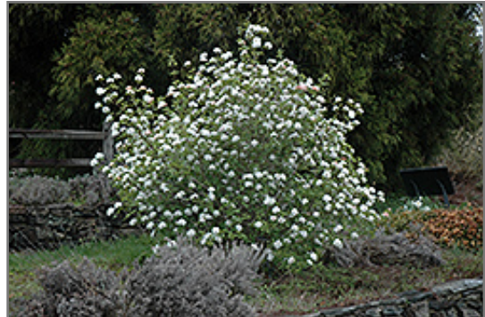
Koreanspice Viburnum in bloom

Koreanspice Viburnum is recommended for the following landscape applications;