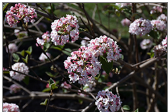
Koreanspice Viburnum flowers