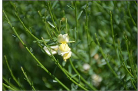
Moonlight Scotch Broom flowers

This shrub should only be grown in full sunlight. It prefers dry to average moisture levels with very well-drained soil, and will often die in standing water. It is considered to be drought-tolerant, and thus makes an ideal choice for xeriscaping or the moisture-conserving landscape. It is particular about its soil conditions, with a strong preference for clay, alkaline soils, and is able to handle environmental salt. It is highly tolerant of urban pollution and will even thrive in inner city environments. This is a selected variety of a species not originally from North America.