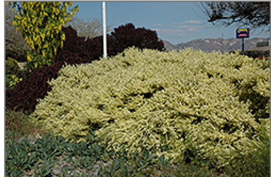
Moonlight Scotch Broom in bloom