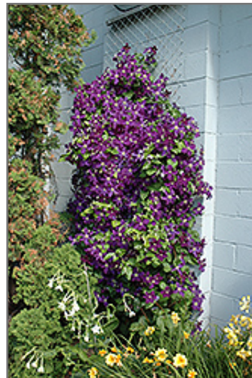
Jackmanii Superba Clematis in bloom