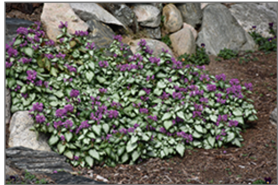
Purple Dragon Spotted Dead Nettle in bloom