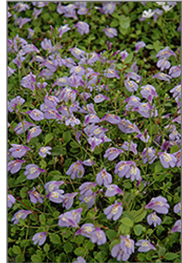
Creeping Mazus flowers

Creeping Mazus is recommended for the following landscape applications;