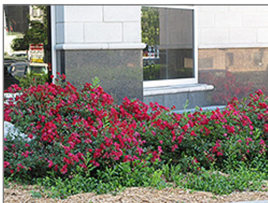
Flower Carpet Red Rose in bloom