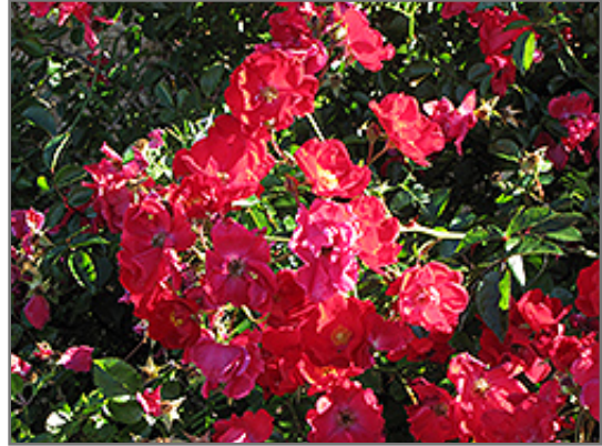
Flower Carpet Red Rose flowers

* This is a 'special order' plant - contact store for details