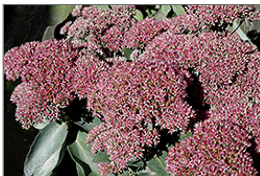
Autumn Delight Stonecrop flowers

Autumn Delight Stonecrop is recommended for the following landscape applications;