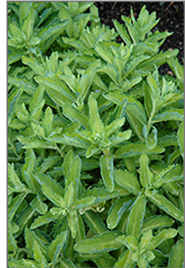
Autumn Delight Stonecrop foliage

Autumn Delight Stonecrop will grow to be about 14 inches tall at maturity, with a spread of 24 inches. When grown in masses or used as a bedding plant, individual plants should be spaced approximately 18 inches apart. It grows at a fast rate, and under ideal conditions can be expected to live for approximately 15 years. As an herbaceous perennial, this plant will usually die back to the crown each winter, and will regrow from the base each spring. Be careful not to disturb the crown in late winter when it may not be readily seen!