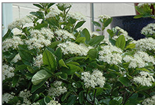
Winterthur Viburnum flowers

Winterthur Viburnum is recommended for the following landscape applications;