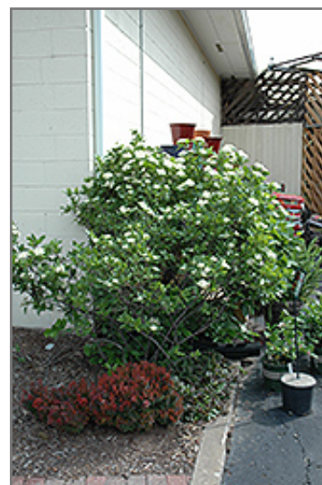
Winterthur Viburnum in bloom