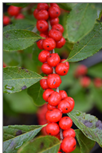
Red Sprite Winterberry fruit