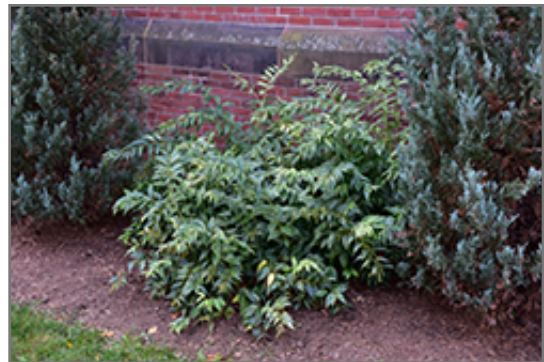
Rainbow Fetterbush