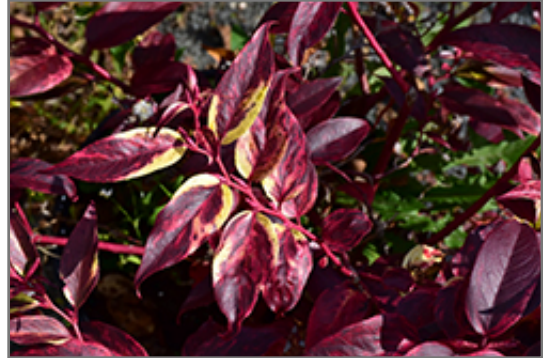
Rainbow Fetterbush in fall

Rainbow Fetterbush will grow to be about 5 feet tall at maturity, with a spread of 6 feet. It tends to fill out right to the ground and therefore doesn't necessarily require facer plants in front, and is suitable for planting under power lines. It grows at a medium rate, and under ideal conditions can be expected to live for approximately 20 years.