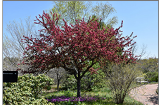
Adams Flowering Crab in bloom