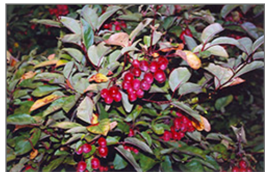
Adams Flowering Crab fruit