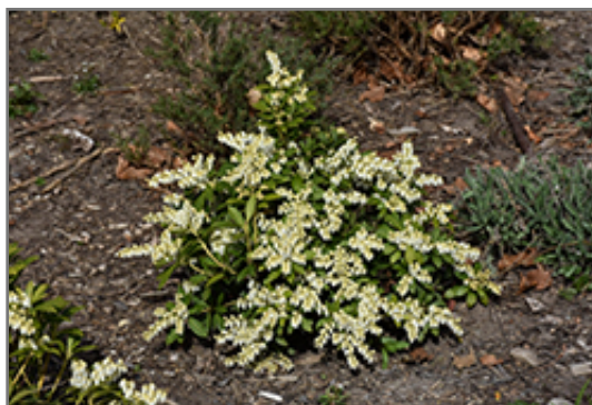
Cavatine Dwarf Japanese Pieris in bloom