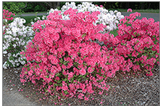
Rosy Lights Azalea in bloom