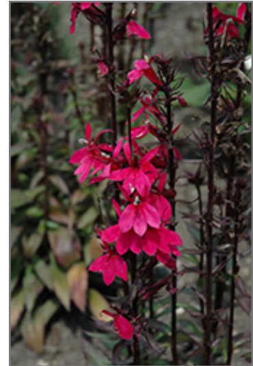
Starship Deep Rose Lobelia flowers