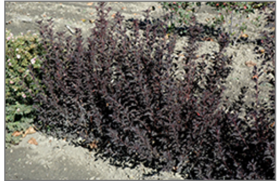
Tiny Wine Ninebark

This shrub does best in full sun to partial shade. It is very adaptable to both dry and moist locations, and should do just fine under average home landscape conditions. It is not particular as to soil type or pH. It is highly tolerant of urban pollution and will even thrive in inner city environments. This is a selection of a native North American species.