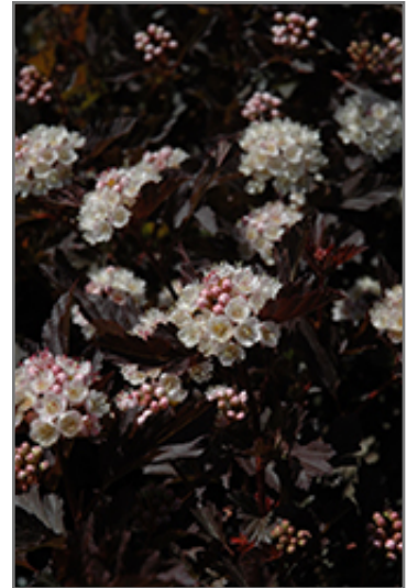
Tiny Wine Ninebark flowers

Tiny Wine Ninebark is recommended for the following landscape applications;