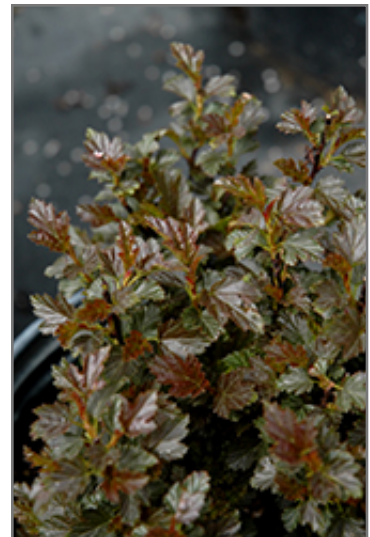
Tiny Wine Ninebark foliage