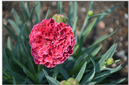
Fruit Punch Raspberry Ruffles Pinks flowers