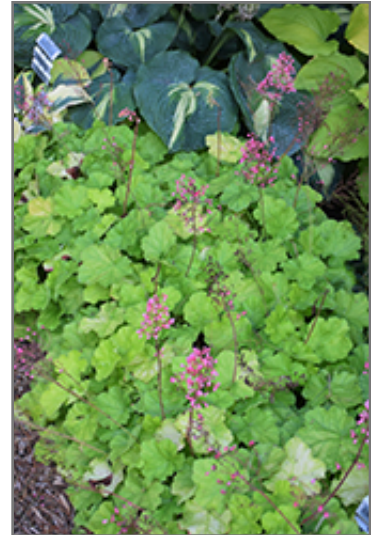
Primo Pretty Pistachio Coral Bells in bloom

Primo Pretty Pistachio Coral Bells is recommended for the following landscape applications;