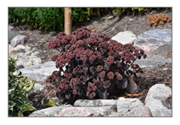
Night Embers Stonecrop in bloom

Night Embers Stonecrop is recommended for the following landscape applications;