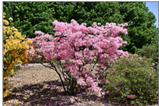
Northern Lights Azalea in bloom