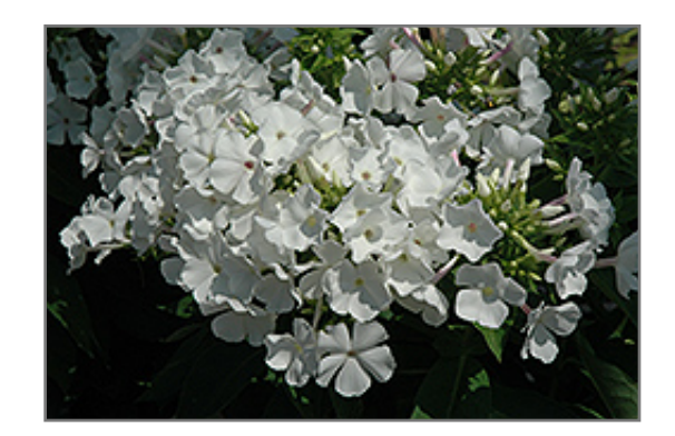
Flame White Garden Phlox flowers