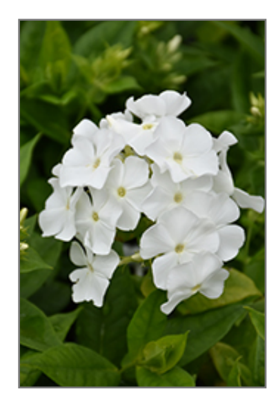
Flame White Garden Phlox flowers