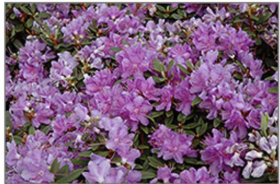
Purple Gem Rhododendron flowers