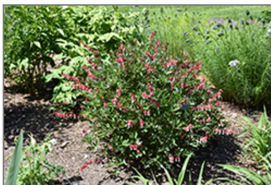
Valentine Bleeding Heart in bloom