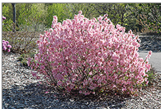
Cornell Pink Rhododendron in bloom