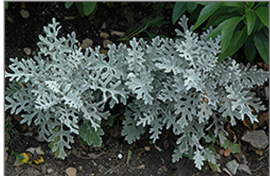
Silver Dust Dusty Miller foliage