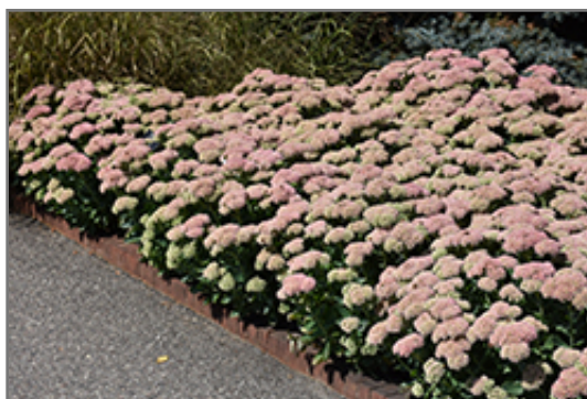
Autumn Joy Stonecrop in bloom