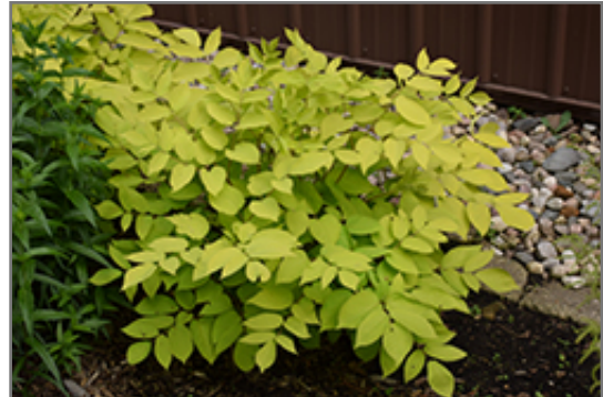
Sun King Japanese Spikenard

Sun King Japanese Spikenard is recommended for the following landscape applications;