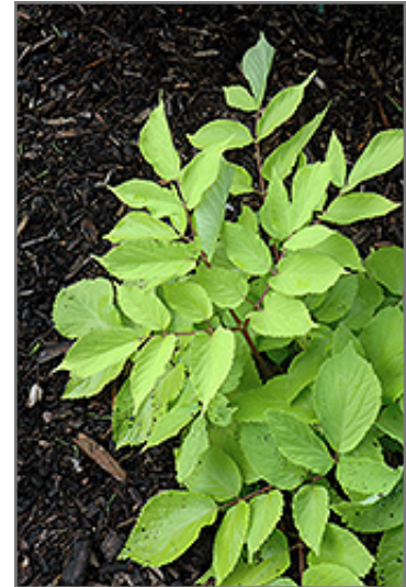
Sun King Japanese Spikenard foliage

This plant performs well in both full sun and full shade. It prefers to grow in average to moist conditions, and shouldn't be allowed to dry out. It is not particular as to soil type or pH. It is highly tolerant of urban pollution and will even thrive in inner city environments. This is a selected variety of a species not originally from North America.