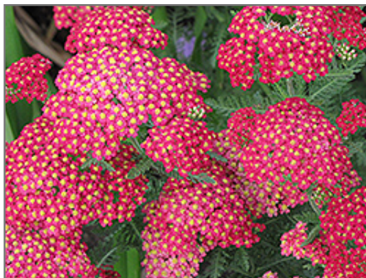
Galaxy Paprika Yarrow flowers

Galaxy Paprika Yarrow is recommended for the following landscape applications;