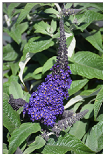
Pugster Blue Butterfly Bush flowers