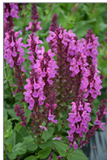
Rose Marvel Meadow Sage flowers

Rose Marvel Meadow Sage is recommended for the following landscape applications;