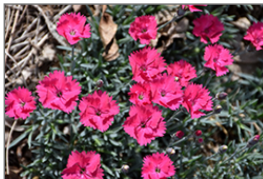
Paint The Town Magenta Pinks flowers