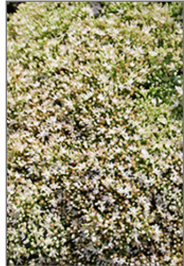
Rock 'N Round Bundle Of Joy Stonecrop flowers

Rock 'N Round Bundle Of Joy Stonecrop will grow to be about 10 inches tall at maturity, with a spread of 18 inches. When grown in masses or used as a bedding plant, individual plants should be spaced approximately 16 inches apart. Its foliage tends to remain low and dense right to the ground. It grows at a fast rate, and under ideal conditions can be expected to live for approximately 15 years. As an herbaceous perennial, this plant will usually die back to the crown each winter, and will regrow from the base each spring. Be careful not to disturb the crown in late winter when it may not be readily seen!