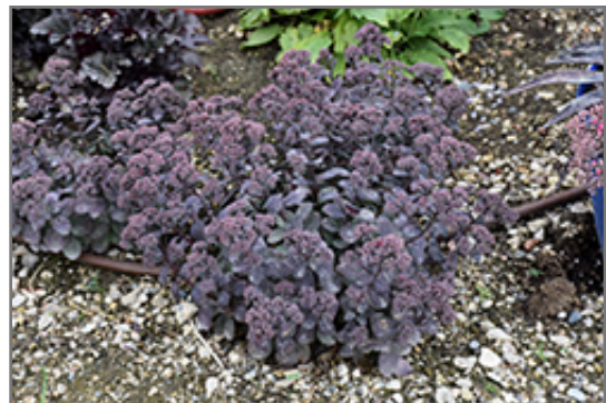
Rock 'N Grow Superstar Stonecrop in bloom