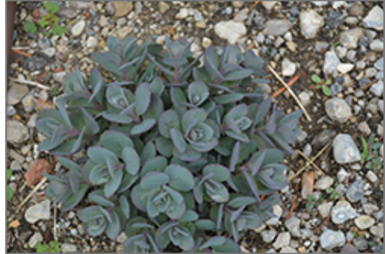
Rock 'N Grow Superstar Stonecrop

Rock 'N Grow Superstar Stonecrop will grow to be about 10 inches tall at maturity, with a spread of 20 inches. When grown in masses or used as a bedding plant, individual plants should be spaced approximately 16 inches apart. Its foliage tends to remain low and dense right to the ground. It grows at a fast rate, and under ideal conditions can be expected to live for approximately 15 years. As an herbaceous perennial, this plant will usually die back to the crown each winter, and will regrow from the base each spring. Be careful not to disturb the crown in late winter when it may not be readily seen!