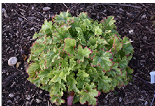
Dolce Apple Twist Coral Bells