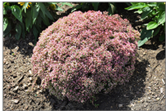
Rock 'N Round Pride and Joy Stonecrop in bloom