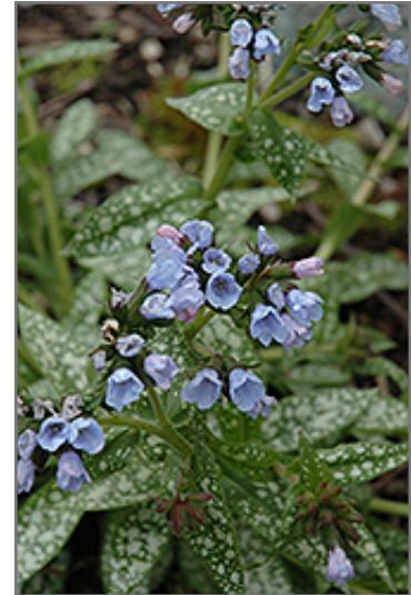
Roy Davidson Lungwort flowers