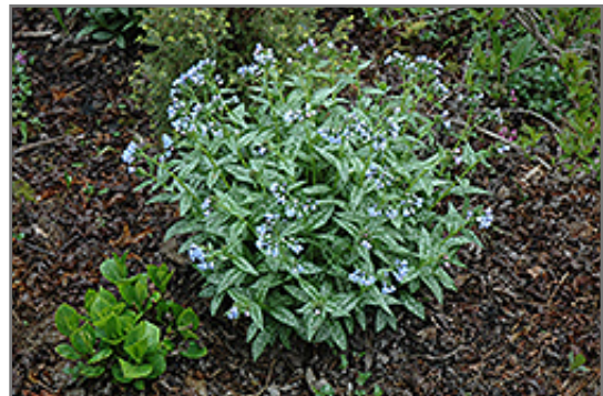
Roy Davidson Lungwort in bloom