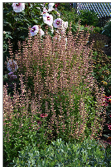
Meant To Bee Queen Nectarine Anise Hyssop in bloom

Meant To Bee Queen Nectarine Anise Hyssop is a fine choice for the garden, but it is also a good selection for planting in outdoor pots and containers. With its upright habit of growth, it is best suited for use as a 'thriller' in the 'spiller-thriller-filler' container combination; plant it near the center of the pot, surrounded by smaller plants and those that spill over the edges. It is even sizeable enough that it can be grown alone in a suitable container. Note that when growing plants in outdoor containers and baskets, they may require more frequent waterings than they would in the yard or garden.