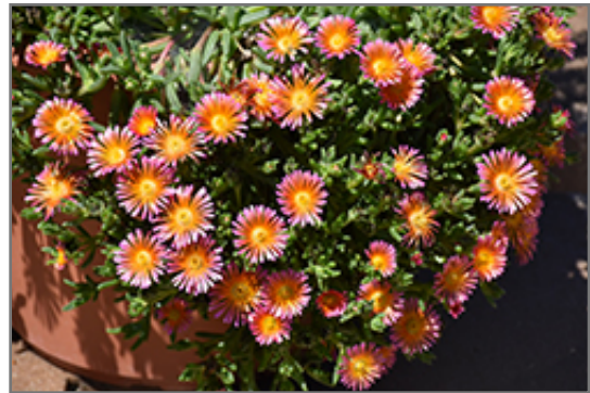
Ocean Sunset Orange Glow Ice Plant flowers