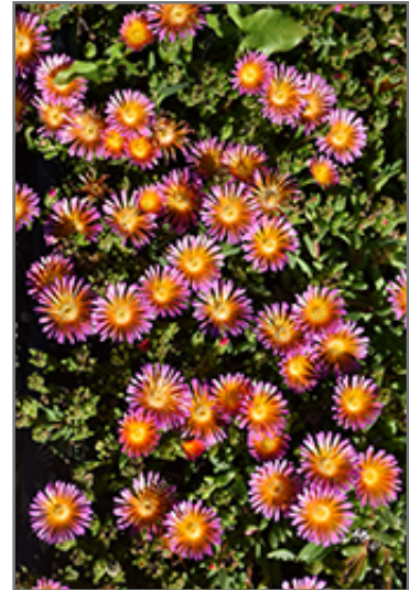
Ocean Sunset Orange Glow Ice Plant flowers

Ocean Sunset Orange Glow Ice Plant is a fine choice for the garden, but it is also a good selection for planting in outdoor pots and containers. Because of its spreading habit of growth, it is ideally suited for use as a 'spiller' in the 'spiller-thriller-filler' container combination; plant it near the edges where it can spill gracefully over the pot. Note that when growing plants in outdoor containers and baskets, they may require more frequent waterings than they would in the yard or garden.