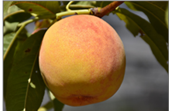
Reliance Peach fruit

Reliance Peach is clothed in stunning clusters of fragrant pink flowers along the branches in early spring, which emerge from distinctive rose flower buds before the leaves. It has dark green deciduous foliage. The narrow leaves turn yellow in fall. The fruits are showy yellow drupes with a red blush, which are carried in abundance in mid summer. The fruit can be messy if allowed to drop on the lawn or walkways, and may require occasional clean-up.