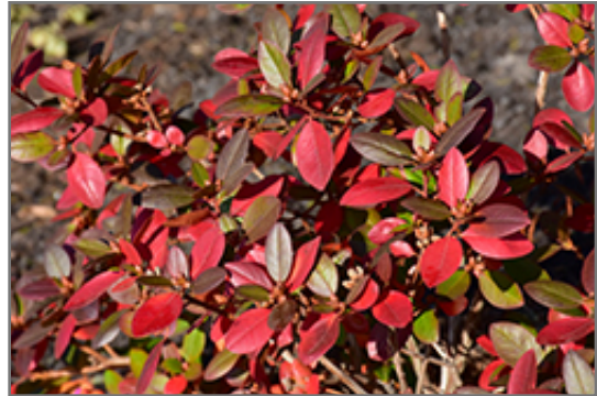
P.J.M. Rhododendron in fall

This shrub does best in full sun to partial shade. You may want to keep it away from hot, dry locations that receive direct afternoon sun or which get reflected sunlight, such as against the south side of a white wall. It requires an evenly moist well-drained soil for optimal growth, but will die in standing water. It is very fussy about its soil conditions and must have rich, acidic soils to ensure success, and is subject to chlorosis (yellowing) of the foliage in alkaline soils. It is somewhat tolerant of urban pollution, and will benefit from being planted in a relatively sheltered location. Consider applying a thick mulch around the root zone in winter to protect it in exposed locations or colder microclimates. This particular variety is an interspecific hybrid.