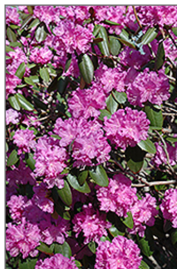
P.J.M. Rhododendron flowers