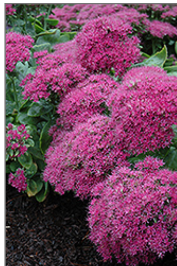
Neon Stonecrop flowers

Neon Stonecrop is recommended for the following landscape applications;