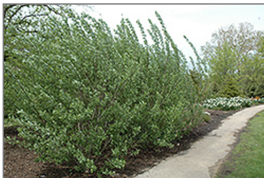
French Pussy Willow