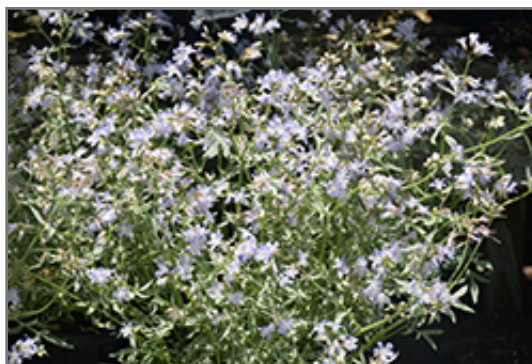
Touch Of Class Jacob's Ladder flowers