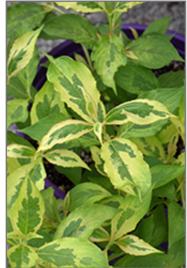
My Monet Sunset Weigela foliage