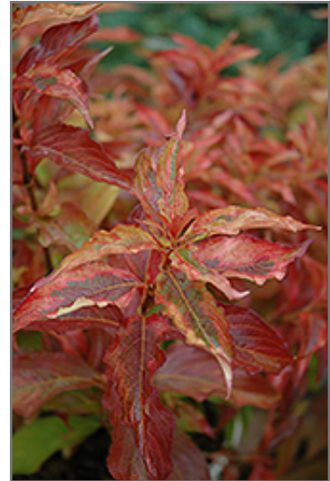
My Monet Sunset Weigela in fall

My Monet Sunset Weigela makes a fine choice for the outdoor landscape, but it is also well-suited for use in outdoor pots and containers. It is often used as a 'filler' in the 'spiller-thriller-filler' container combination, providing a mass of flowers and foliage against which the thriller plants stand out. Note that when grown in a container, it may not perform exactly as indicated on the tag - this is to be expected. Also note that when growing plants in outdoor containers and baskets, they may require more frequent waterings than they would in the yard or garden.