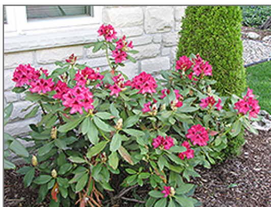
Nova Zembla Rhododendron in bloom